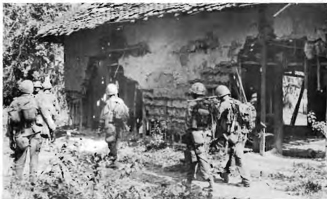
SEARCH AND DESTROY: Gone today, here tomorrow (maybe) Viet Cong are elusive