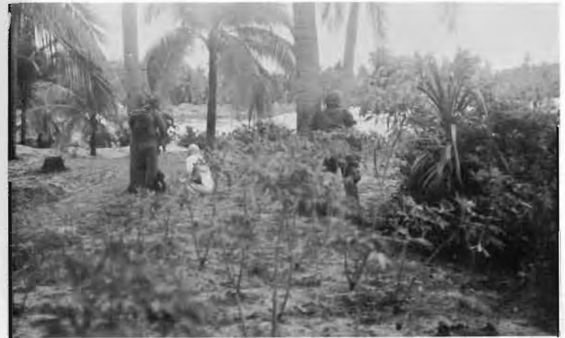
Bin Dinh Valley during Operation MASHER. Troopers alert for the enemy after receiving VC sniper fire