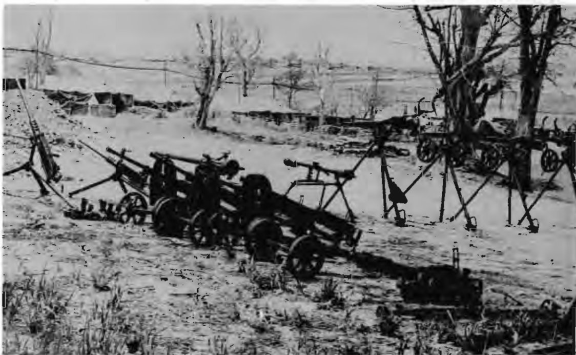
Captured Viet Cong weapons displayed at the 1st Cavalry Division (Airmobile) Museum, at An Khe. (June 1966)