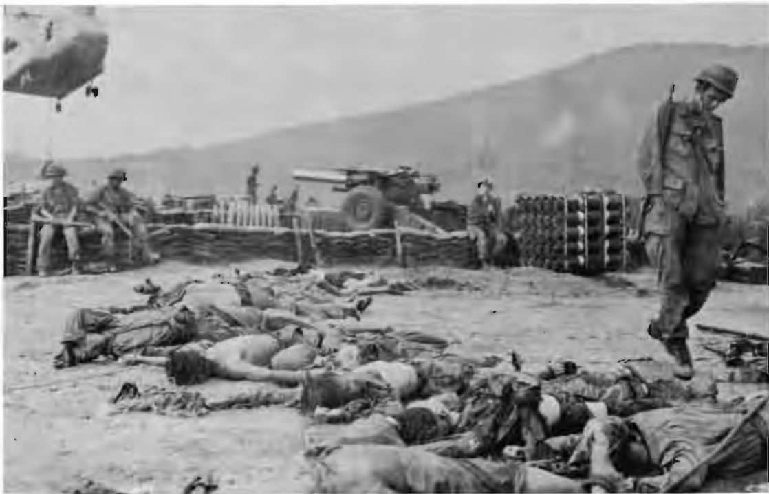
THAYER II, Kim Son Valley, LZ BIRD: Enemy dead, 27 Dec 1966