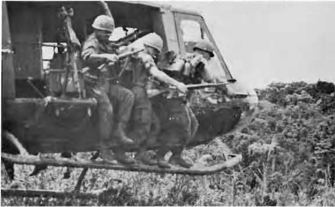
Sky Troopers of 1/9 Cavalry stand on the skids, waiting to drop into landing zone in Operation PERSHING