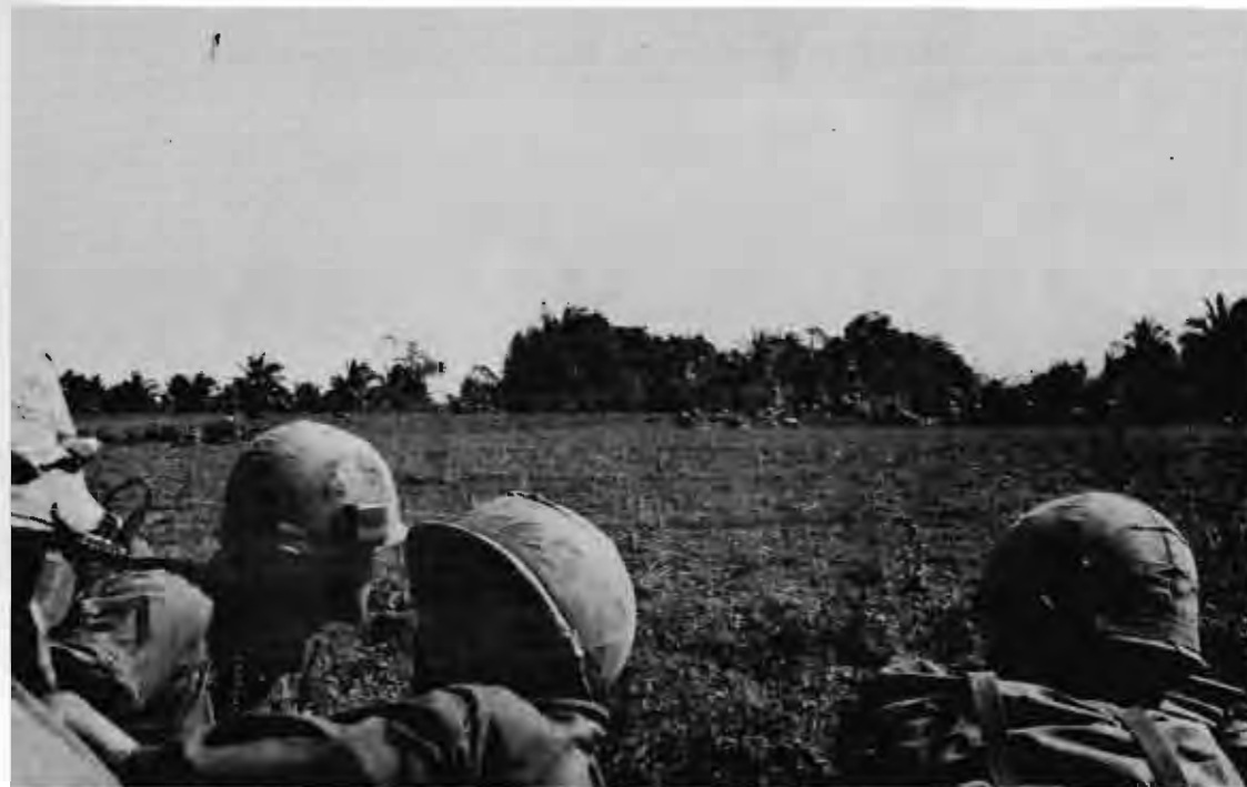
LZ TROUT: Sky Troopers of 2/12 Cavalry under fire from estimated two battalions of mixed North Vietnamese and Viet Cong