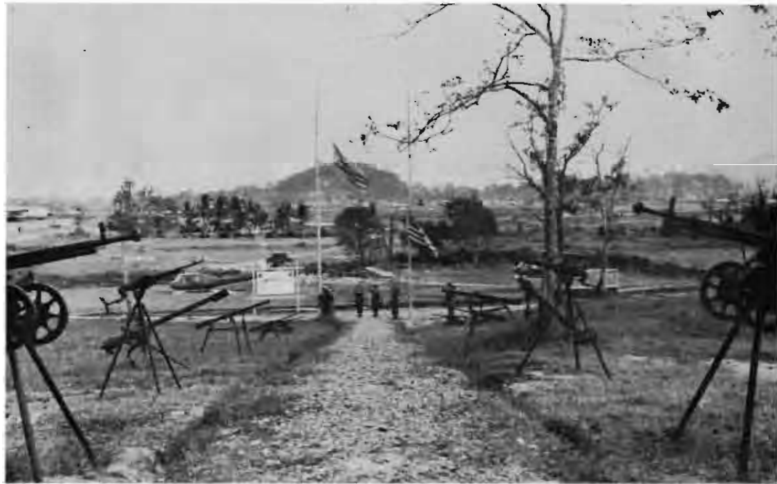
Retreat Ceremony at Camp Radcliff, An Khe, 23 Nov 66