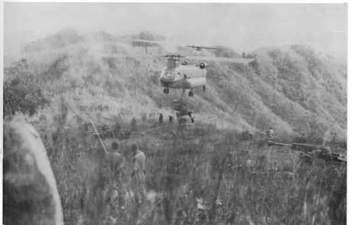
This CH-47 lifts a 105mm howitzer into position to begin an artillery raid.