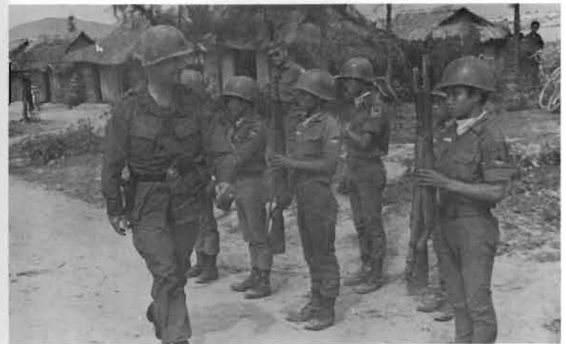
The Division Commander visited a squad of ROK troops.