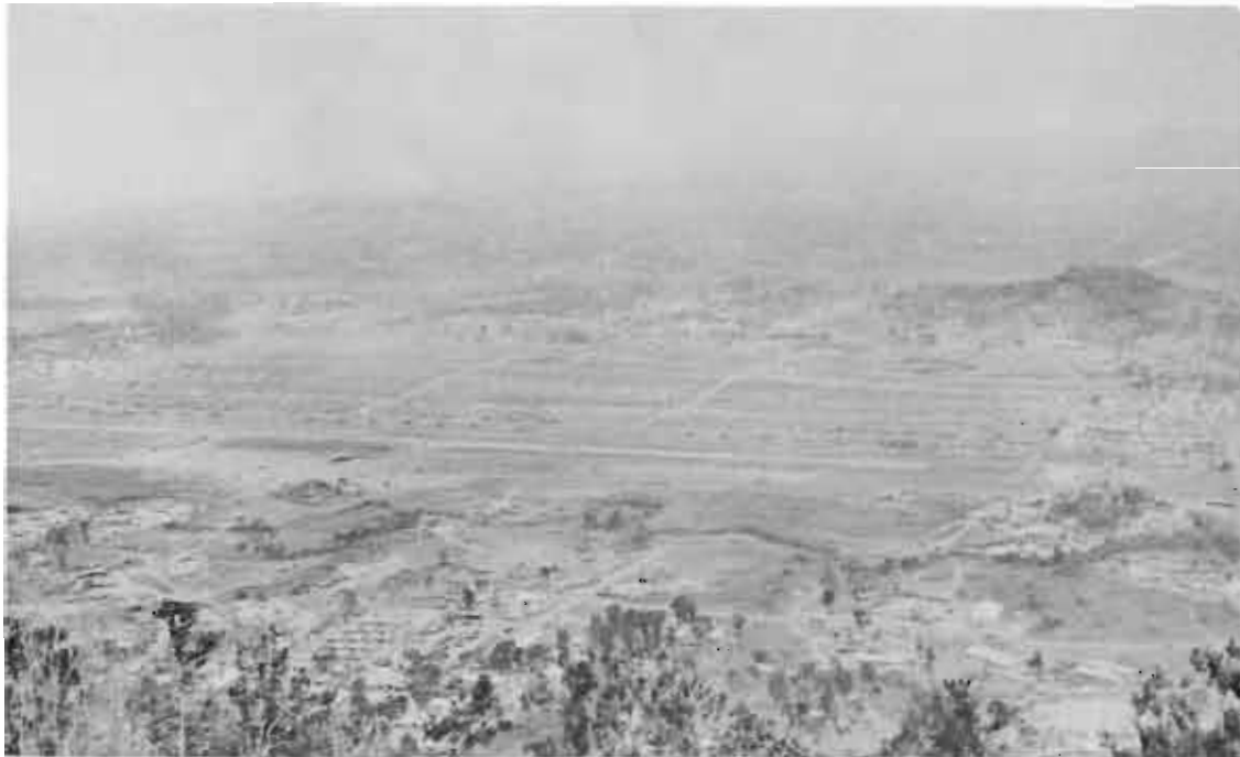
Panoramic View of the "Golf Course"—the world's largest helipad—and the surrounding area. Photograph was taken from Hong Cong Mountain, facing East, after the base camp in the foreground had been developed.