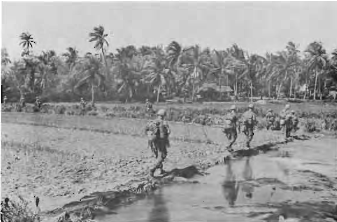
Elements of B 2/12 cross rice paddy on clearing mission