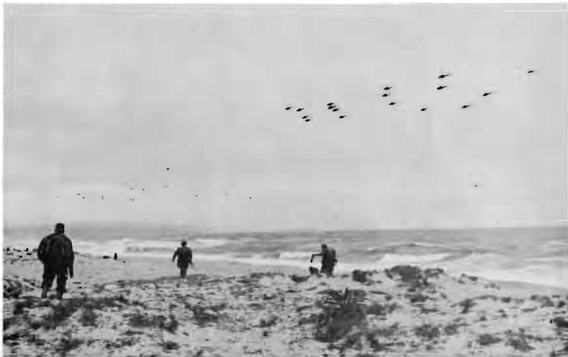
OPERATION PERSHING, along the South China Sea. Sky Troopers on the ground and helicopters in the air work together to mop up Vietcong remnants.