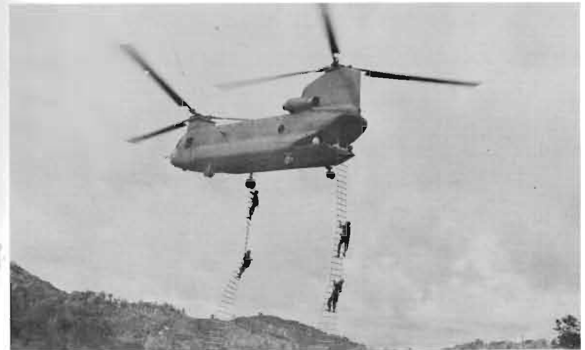
The CH-47 CHINOOK can put men into position via rope ladders. The first 50 descents are the hard ones.