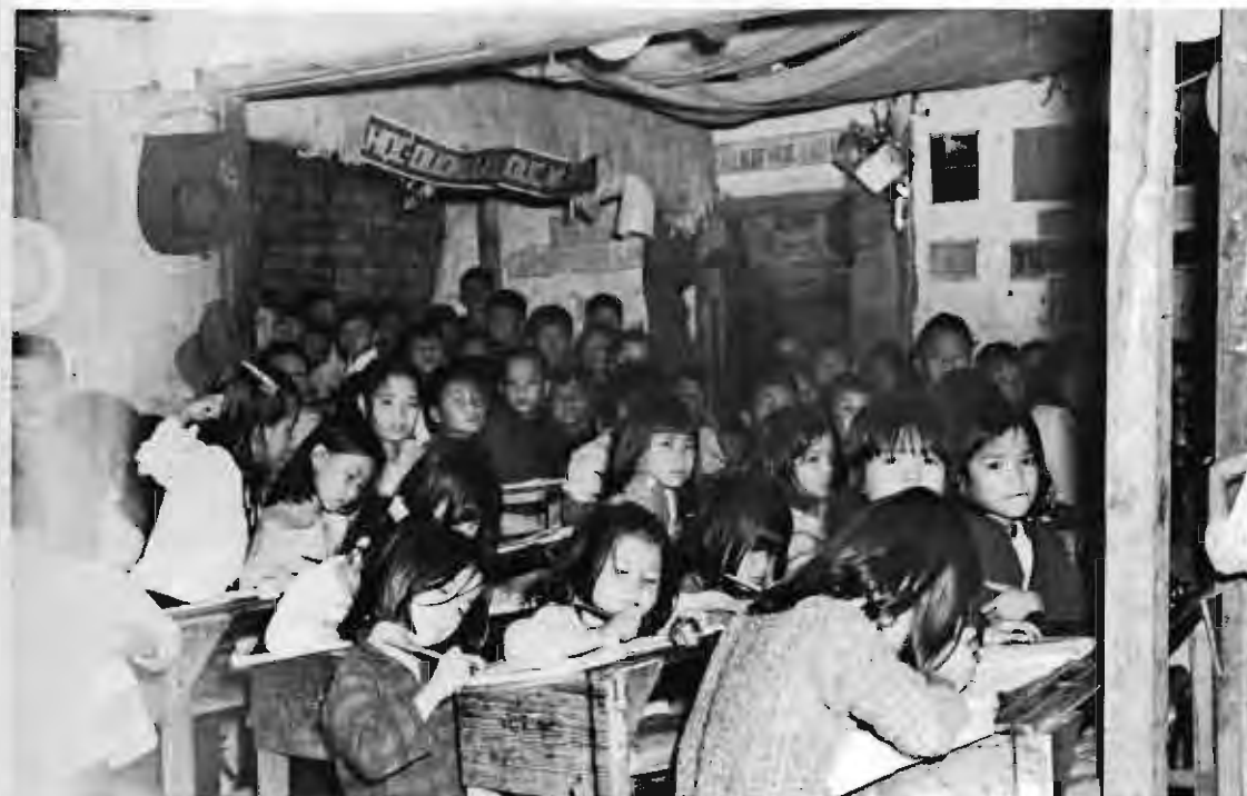
Vietnamese children in school at Old An Khe