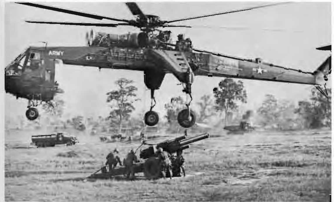
CH-54 SKYCRANE emplacing 8" howitzer