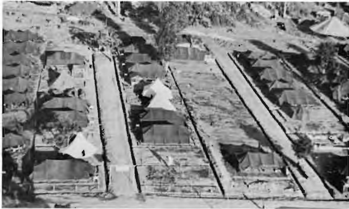
An Khe—by Christmas of 1965 the Base Camp had developed to the degree shown in aerial photo.