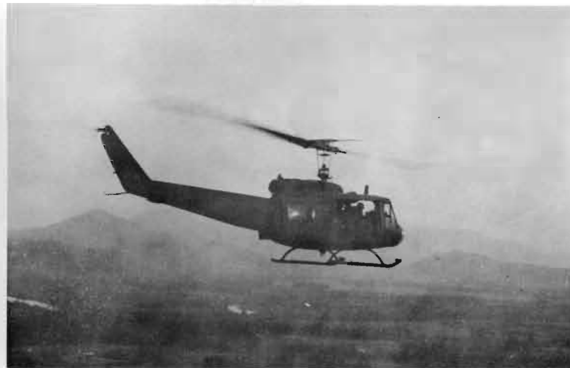
This HUEY is carrying men of A 1/9th Cavalry to LZ Two Bits. Oct 1966.