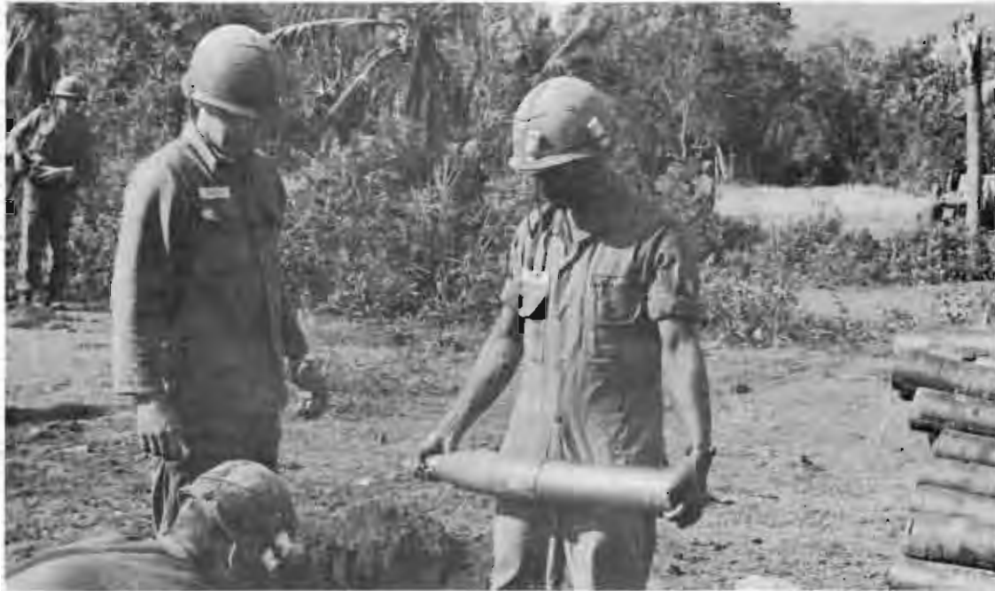
Operation MASHER north of Phu Cat, January 1966. Howitzer crew (B Btry 2/21 Arty) preparing ammo for fire support