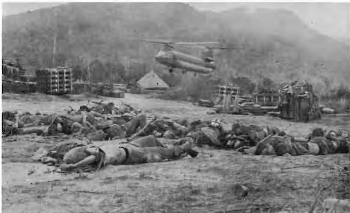
One of the bloodiest encounters occurred at LZ BIRD in Kim Son Valley during THAYER II. These are enemy dead on 27 Dec 1966.