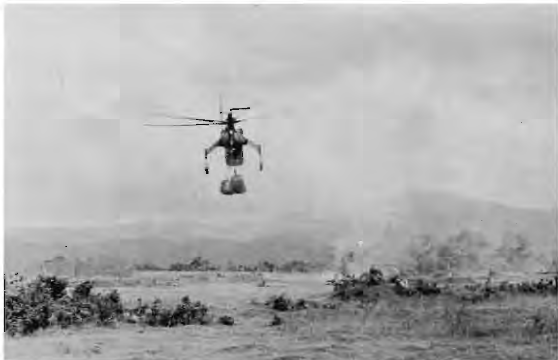
CH-54 SKYCRANE delivering POL in bladders at LZ TWO BITS, ....near BONG SON