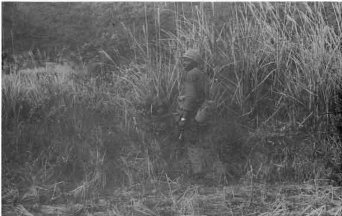
January 1966. After securing LZ, troopers move into perimeter positions. (Operation MASHER, north of PHU CAT)