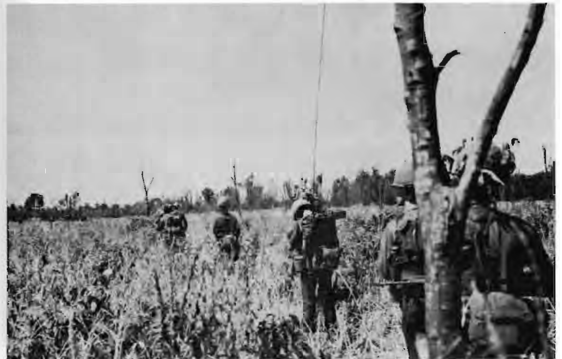
On patrol in "Happy Valley"