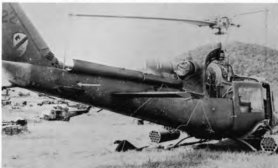
Choppers don't go unscathed. A HUEY ARA rocket ship with bullet and shrapnel holes after Camp Radcliff was mortared, Sept. 3, 1966.