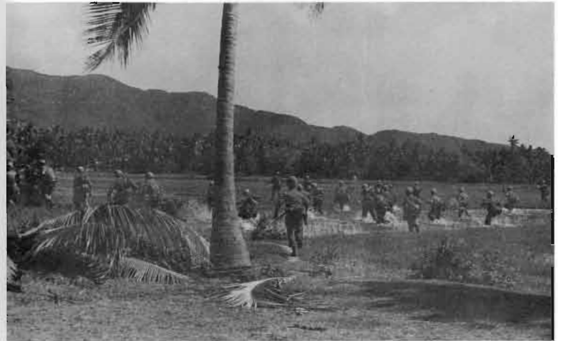
Search and Destroy. A rice paddy north of Phu Cat 25 Jan 1966 (Operation MASHER)