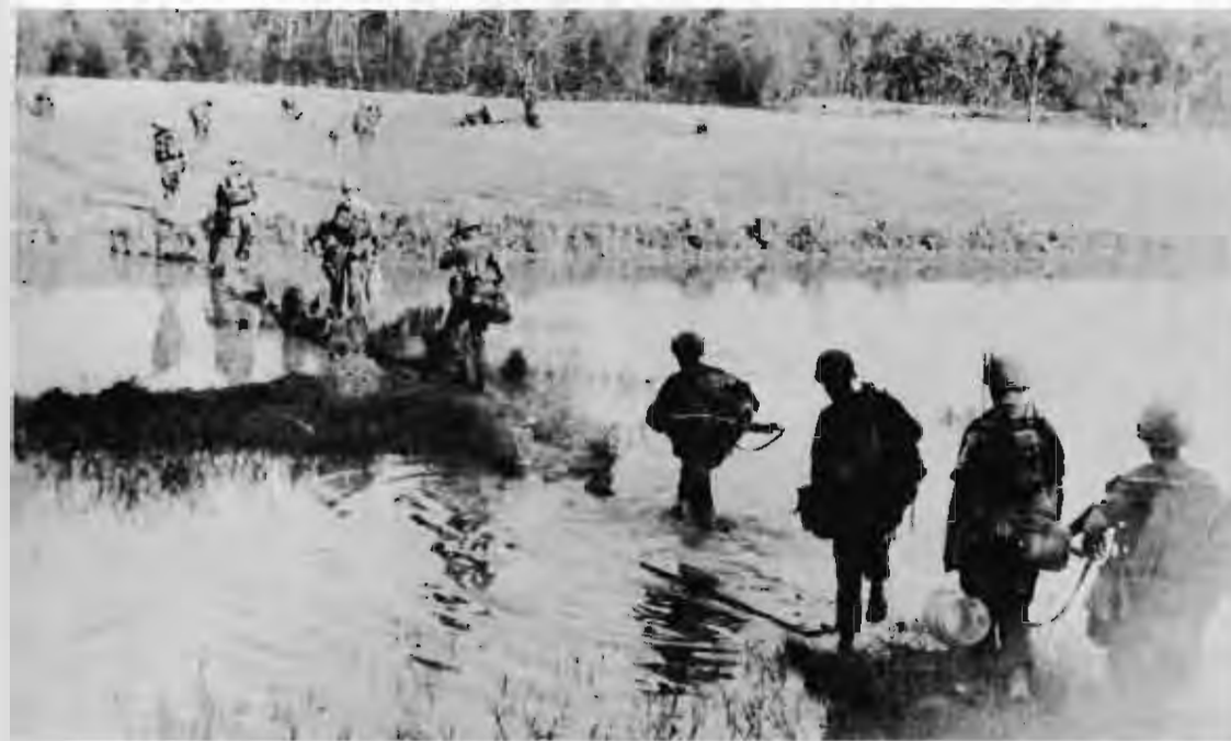
SEARCH AND DESTROY—a frustrating business; more often than not the Viet Cong exfiltrate before contact is made