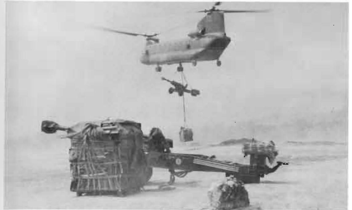
PIGGY-BACK. One Chinook carries away a 105mm howitzer and ammo load; another Chinook will be along to pick up the remaining load.