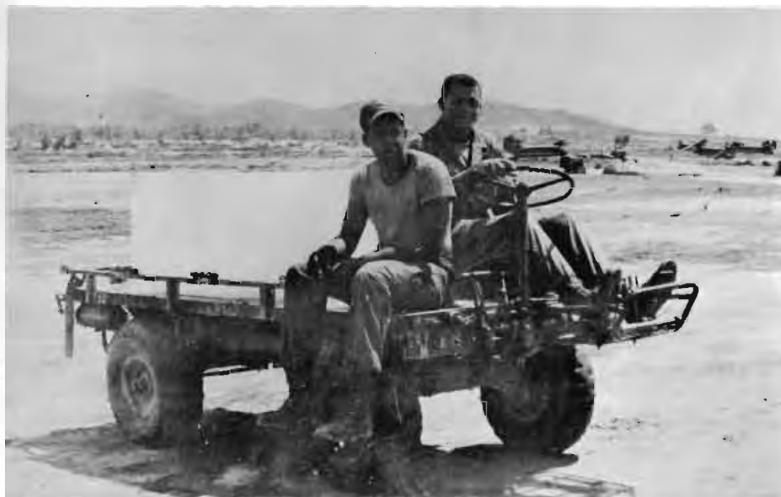
THE ARMY "MULE" transporting ice to the 15th Medical Hospital. (October, 1966)